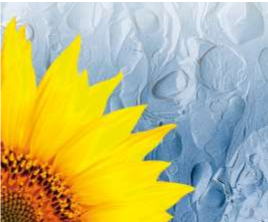
Lamellar structures of the SLM Skin Lipid Matrix with Sunflower