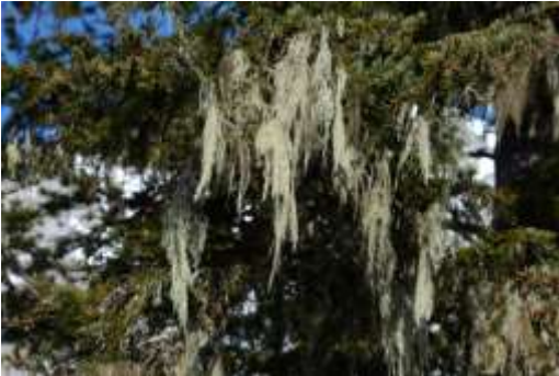
Lichen Usnea barbata hanging on a tree in Switzerland