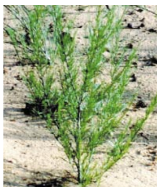
Fig. 1: Rooibos plant

shrub which is indigenous to the North Western Cape of South Africa, in the area of the Cederburg Mountains 1,6 . It is a member of the legume family, Fabaceae. The plants can survive in extreme and nutrient poor conditions because of their very deep tap roots 3,5 . The Rooibos plant is a green shrub that grows between 1.5 and 2 metres high, with fine needle-like leaves (Fig. 1). In fact the name is misleading because neither is it red in its natural habitat, the colour develops later during the fermentation process, nor is it a true tea (from the tea plant Camellia sinensis ).